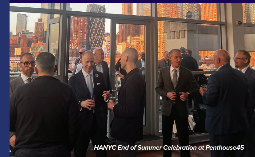
HANYC End of Summer Celebration at Penthouse45