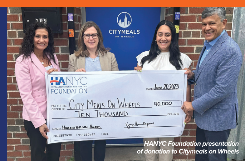
HANYC Foundation presentation of donation to Citymeals on Wheels