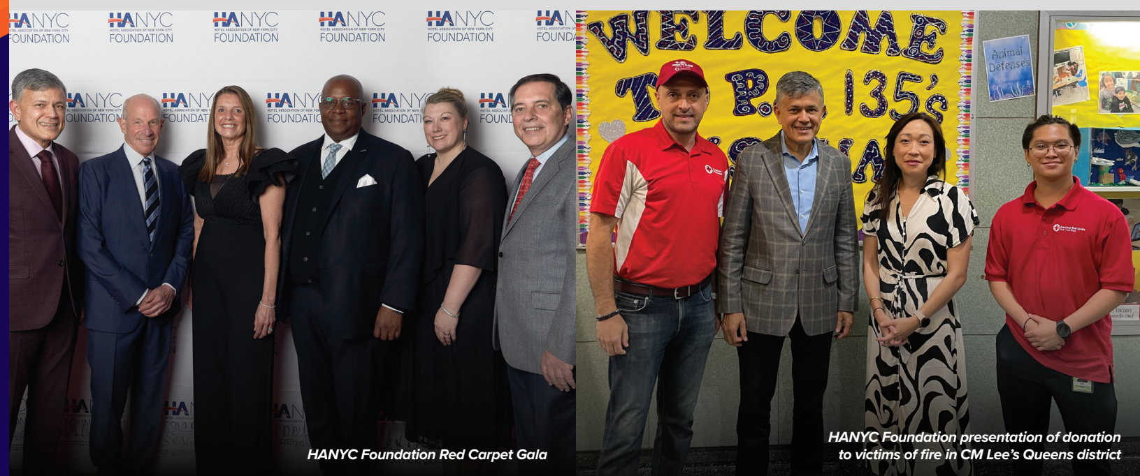
HANYC Foundation Red Carpet Gala

HANYC continues to engage in extensive outreach to City Council Members and senior staff from the Mayor's Administration to illustrate that the Hotel Industry has not yet fully recovered from the impact of the pandemic. To illustrate: despite significant ADR growth real (adjusted for inflation), RevPar exceeded 2019 levels only in September and October of 2024.